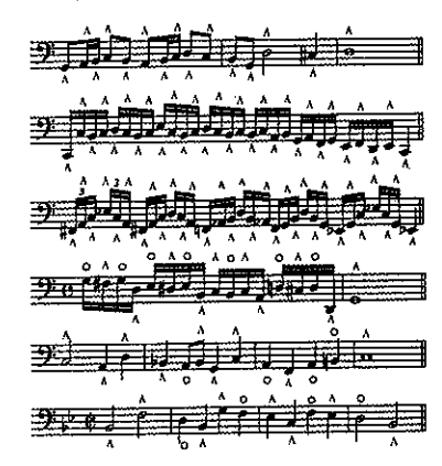
Example 7 - Pedal examples from J.H. Knecht

The pieces in Knecht's book are in a galant style for the most part and do not make use of the pedal technique that he has described.